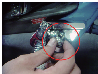
2. 安裝不鏽鋼螺絲 M10*1.25*20 和螺母M10

1. INSTALL SIDE STAND ON THE LEFT SIDE OF MOTOR.